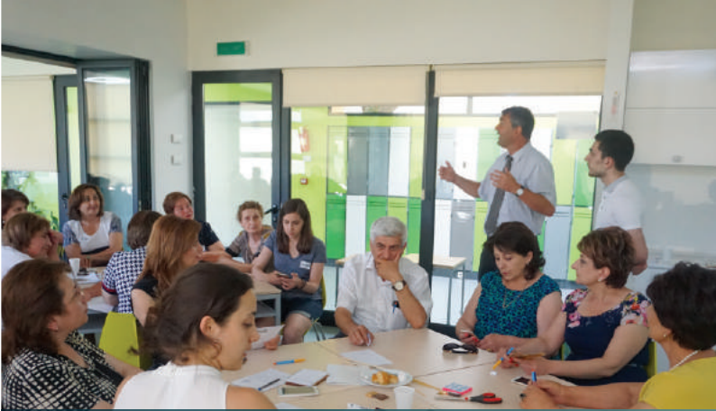
UCL Institute of Education -Teacher Training Partner