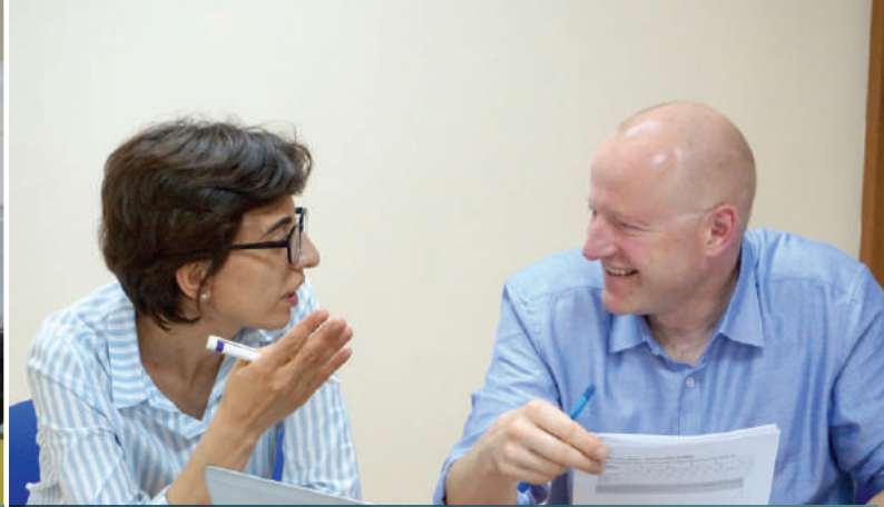
Cambridge Assessment-Examinations Partner